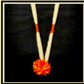
Code: A1005 Price: Rs. 30/-