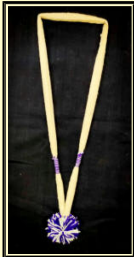
Code: A1001 Price: Rs. 30/-