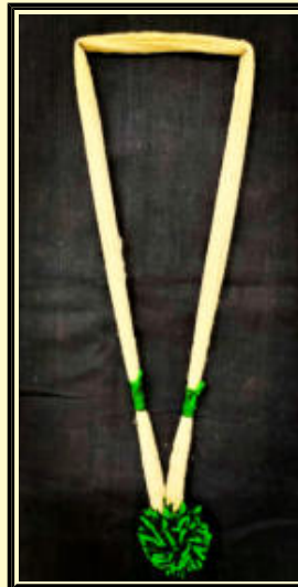
Code: A1003 Price: Rs. 30/-