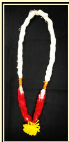
Code: A1012 Price: Rs. 40/-

Note: These products have been made by the students of MBA (RM) under subject "Udyog" as an integral part of academic programme aiming at holistic development of students.