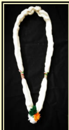
Code: A1009 Price: Rs. 35/-