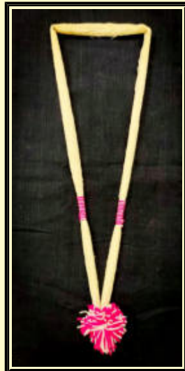
Code: A1002 Price: Rs. 30/-