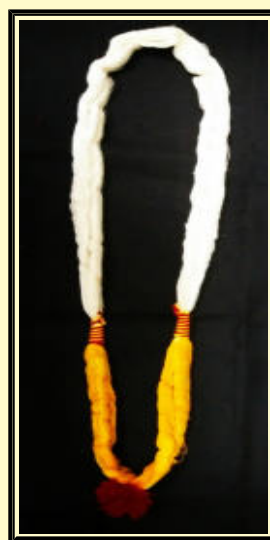
Code: A1011 Price: Rs. 40/-