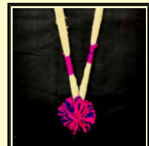
Code: A1008 Price: Rs. 30/-