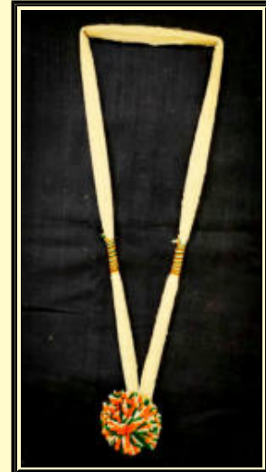
Code: A1004 Price: Rs. 30/-