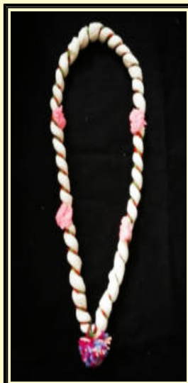
Code: A1010 Price: Rs. 40/-