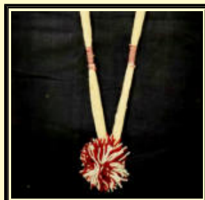
Code: A1006 Price: Rs. 30/-